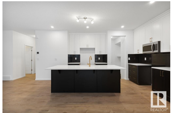
37484026 – Interior Selection Photo – Main Floor

MLS® # E4428135 Price $647,990 Bedrooms 4