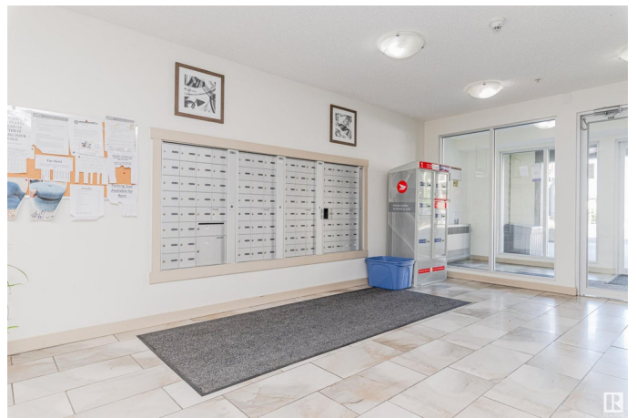
223-5816 Mullen Pl NW, Edmonton, AB